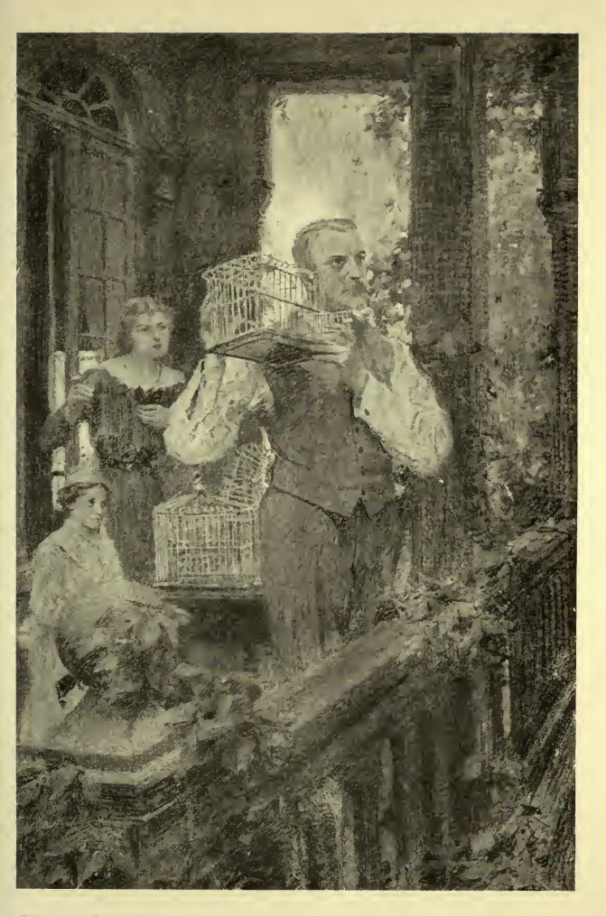
He was inordinately busy releasing the last canary from the fifth cage.